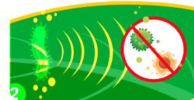
Production of bacteriostatic & fungistatic molecules