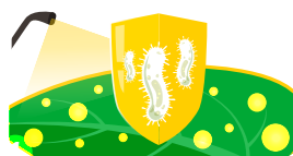
Colonisation of treated surfaces by Bacillus subtilis